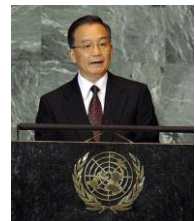
Chinese Premier Wen Jiabao, addressing the Tianjin meeting on Saturday, said: "Confidence is more precious than gold and currency at the moment."