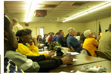
Allegan County Delegation