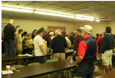
Obama Caucus were everyone was told how to vote

I really do not like choreographed conventions were people are just a necessary nuisance to be dealt with.