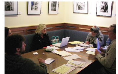
Investigators collating evidence

One of our investigators went to Cornerstone Alliance and asked to see the actual records of what this money was spent on. You would expect that Cornerstone Alliance would just say "yes" and make an appointment for him to come in and look at those records. That is not what happened. They refused to allow him to see the records, and hired a very expensive attorney from a major law firm that special-