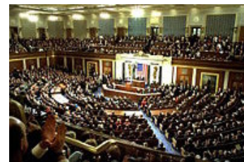
United States House of Representatives

that would be where you lived. Voting would done on computers from anywhere you were in the world, and you would create a pseudonym on your vote that would be placed into the database using a random shuffle. You could immediately go to that database and look up your pseudonym that only you would know and verify that the vote you are looking at is your vote. It would put the power of government back into the hands of the people.