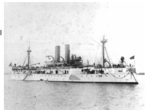
USS Maine Mysteriously blew up in Havana Harbor

Here we are over 100 years later, the names have changed, it is now oil instead of lumber, Iraq instead of Cuba, 9/11 instead of the Maine, but it's still business as usual.