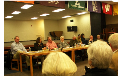
Saugatuck Township Board of Trustees