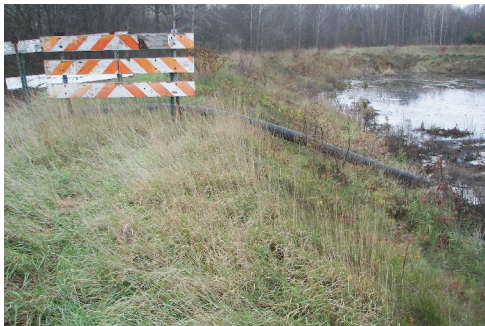
Pipe carrying dredgings going to the containment pond