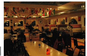
Family Style Restaurant