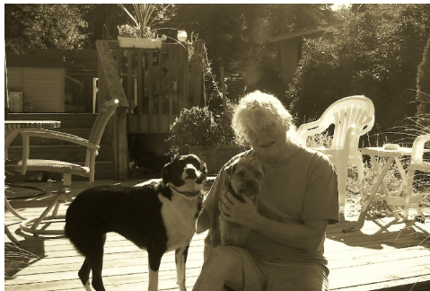
Editor and family

In the first month this website is up, it has setup links to a significant number of local and national websites that covers the real news. Web pages also link to video and audio of alleged election fraud, local meetings, and national events. It also has the ability to get immediate